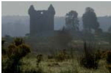
Monea Castle.