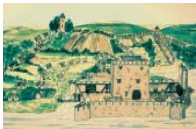
Enniskillen Castle and town c. 1620. Conjectural drawing by D Warner.

However, despite the failure of the centrepiece of the Rising the spark of rebellion lit a fire throughout Ulster. Alone, the Plantation garrison in Enniskillen held out against the forces of the Rising. Rory Maguire, Conor Maguire's brother, himself affiliated to the planter community by marriage to Edward