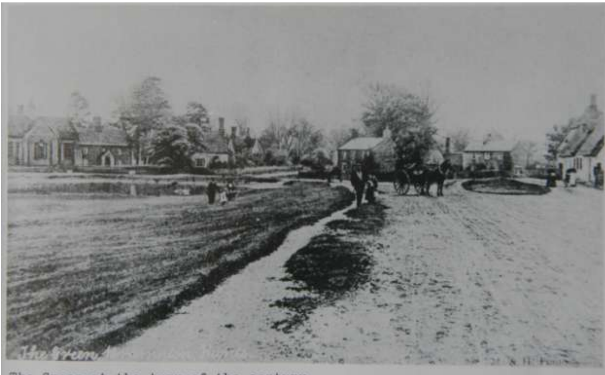
The Green at the turn of the century

The American Air Force occupied the Park for a short while but the R.A.F. moved back again. A lot of building has taken place and I believe this is a popular posting for members of Her Majesty's Forces, but the estate is completely unrecognisable to one who would have only known it at the turn of the century. Happily the east lodge has been renovated and retained in its 18th century thatched roof-one storey high condition and is there to remind us what life could have been like in those days.